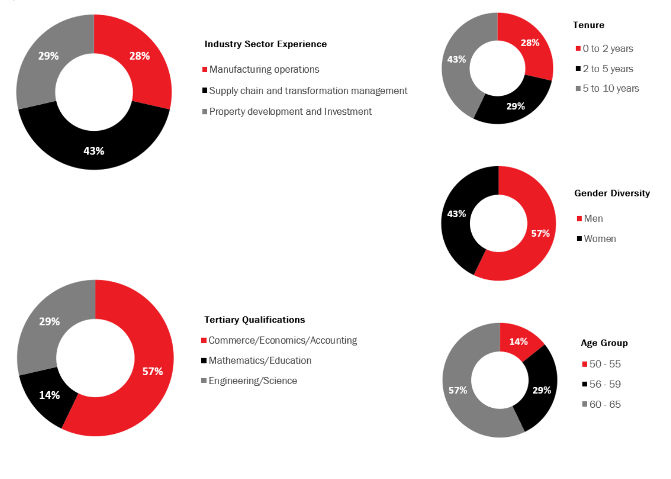
Figure 1: Board diversity

The table on the following page sets out the skills and experience the board considers essential for effective governance, including the current representation of those skills and experience on the board.