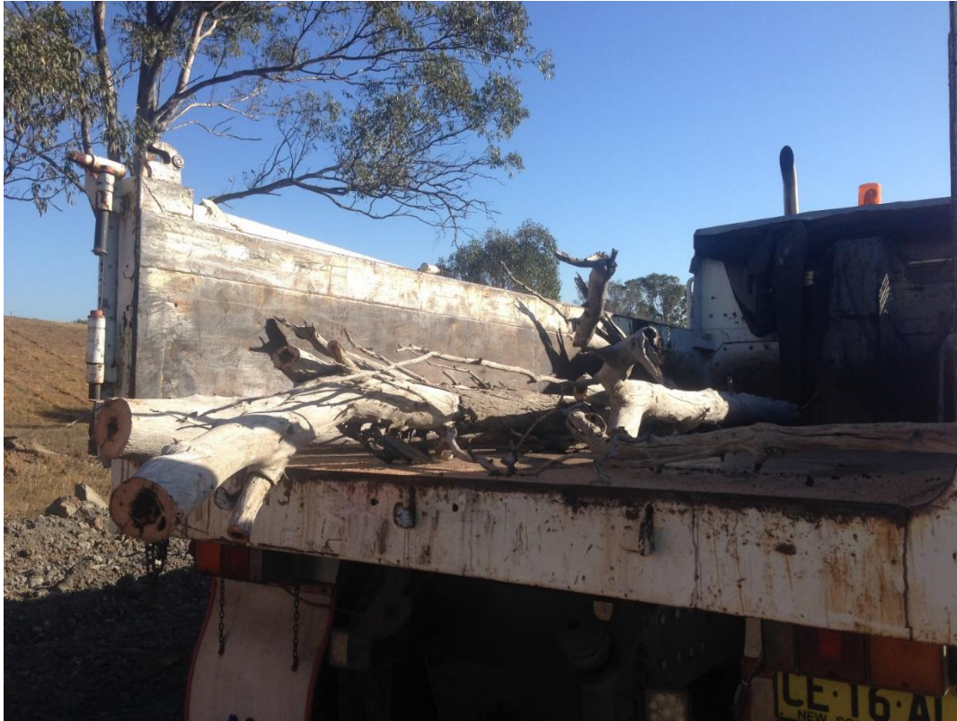
Figure 3: Retention of hollow sections for installation in the conservation lot