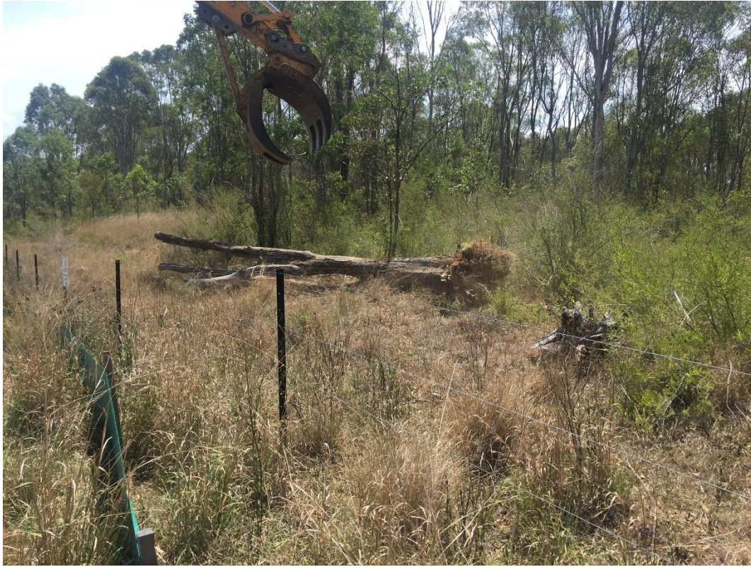
Figure 5: Placement of retained logs and hollows in the conservation lot